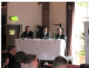
A panel of pharmacists, BAPW Conference 2008